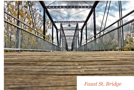
Faust St. Bridge